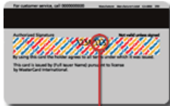
Card ID #

Visa You will find Visa's 3-digit security digit printed on the signature panel located on the back of the card immediately following the account number.