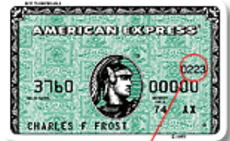
Card ID #

MasterCard You will find MasterCard's 3-digit security digit printed on the signature panel on the back of the card.